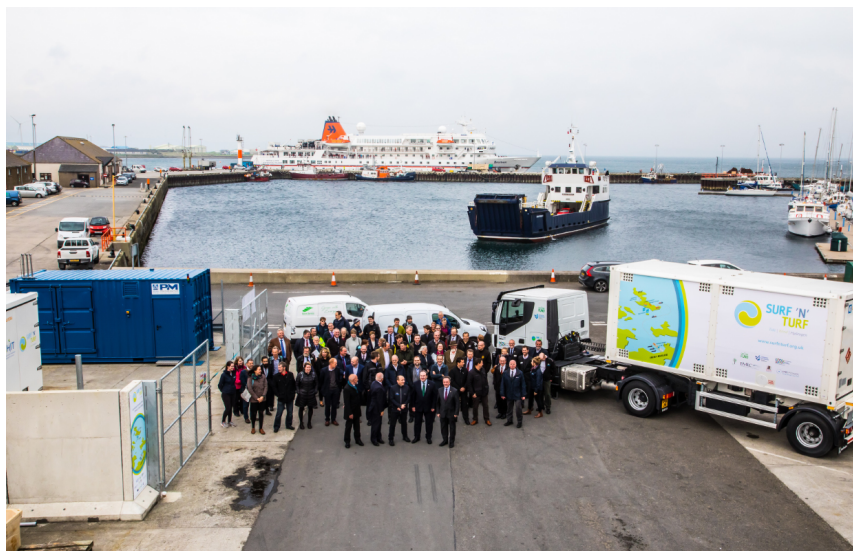
Destination Kirkwall: The current Shapinsay ferry with the chosen route for HYSEAS III project in the background. HYSEAS III will combine with Surf N Turf hydrogen project to provide the replacement vessel with a Hydrogen fuelling facility

The successful test will allow a vessel to be constructed, in the already assured knowledge that such a vessel can operate safely and efficiently around Scotland's challenging coast. The vessel is planned to operate in and around Orkney - which is already producing hydrogen in volume from constrained - and hence otherwise wasted - renewable energy.